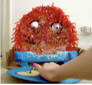
“Sun” tangible UI exercises (2004)