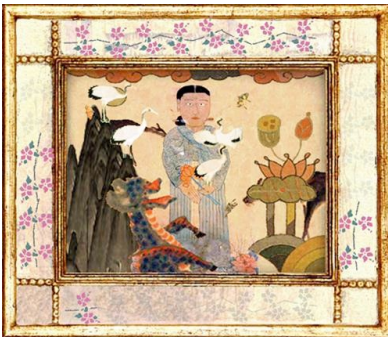
Awareness system for international students (2004)