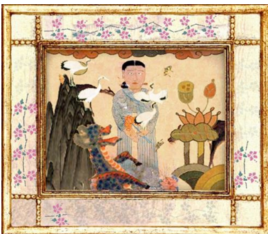
Awareness system for international students (2004)